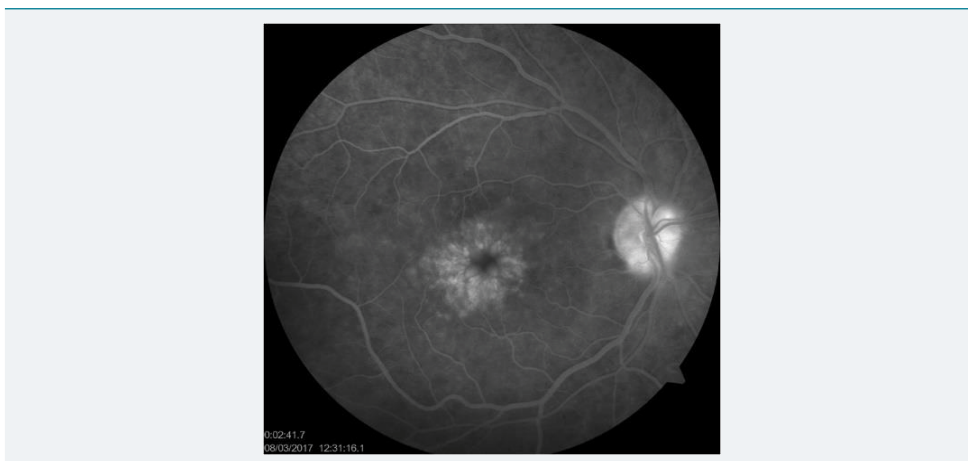
Figure 1: Petaloid perifoveal leakage and hyperfluorescence of optic nerve on fluorescein angiography (FA).