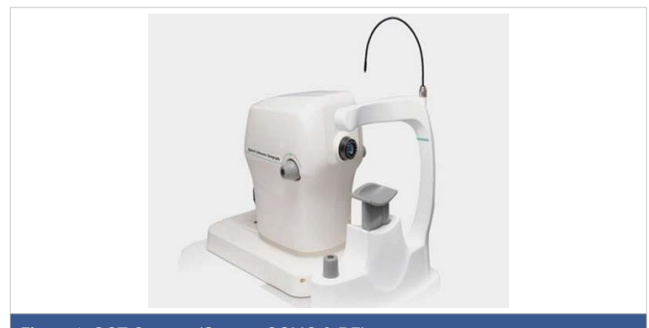
Figure 1: OCT Camera

There are different neuropathology tests and techniques for diagnosing AD. Some of the most advanced tests include functional magnetic resonance imaging, positron emission tomography and single photon emission computed tomography techniques. These techniques are very expensive, and a common man cannot afford the expense. In this scenario, OCT imaging technique is very useful for diagnosing the disease, as it very reliable and economically good. With the