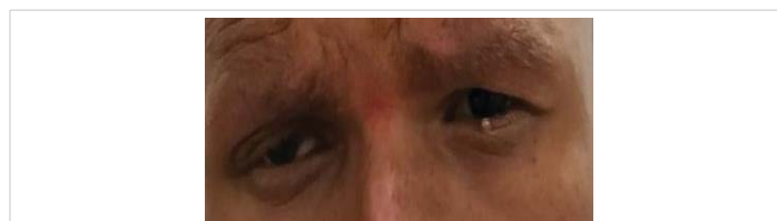
Image 2: Showing loss of eyebrow eyelashes and poliosis. Entropion. Cyst of Zeiss, brow ptosis.