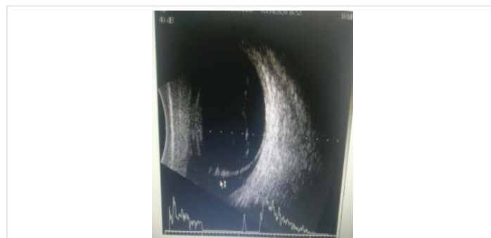
Image 4: Ultrasound Bscan right eye shows high spike membranous opacity indicating inferior RD.