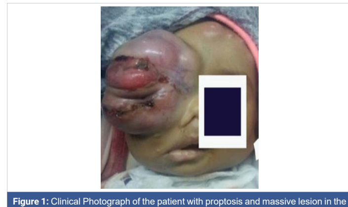
right eyelid 5 days after the imitation of chemotherapy.

unremarkable. Computed tomography (CT) scans showed a large irregular but well-circumscribed mass in the anterior and inferior of the right eyelid with retrobulbar extension (Figure 2), there was no lesion in the optic nerves and no metastasis suggestive of a malignant process. An incisional biopsy was taken directly overlying the tumor and a tissue sample was sent to Tikur Anbesa specialized hospital for histologic studies. The biopsy showed ill-defined aggregates of poorly differentiated malignant cells that are loosely arranged and separated into irregular ovoid spaces by thin fibrovascular septa (Figure 3). In this case, it was not able to perform an immunohistochemical examination.<sup>[]</sup> In addition to RMS, meningocele, orbital teratoma, hemangioma, and