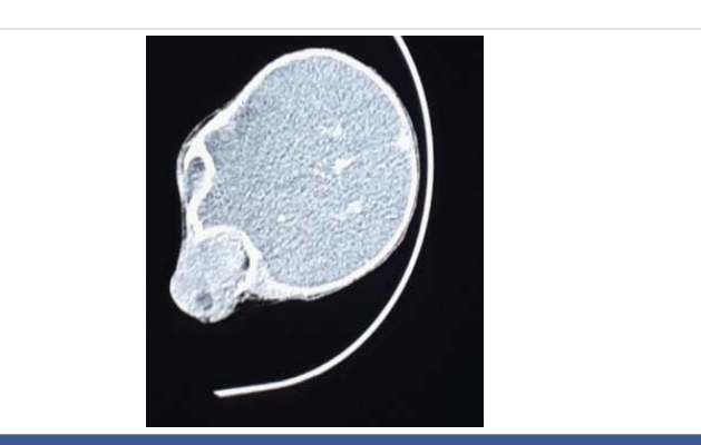
Figure 2: Orbital CT Scan without contrast showed a large isodense mass filling the orbit and extending to the maxillary and ethmoidal sinus.