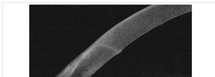
Figure 1: SD-OCT after cataract extraction showing the 1.8mm corneal incision.

To analyze statistically all samples a SAS V9.1 programming