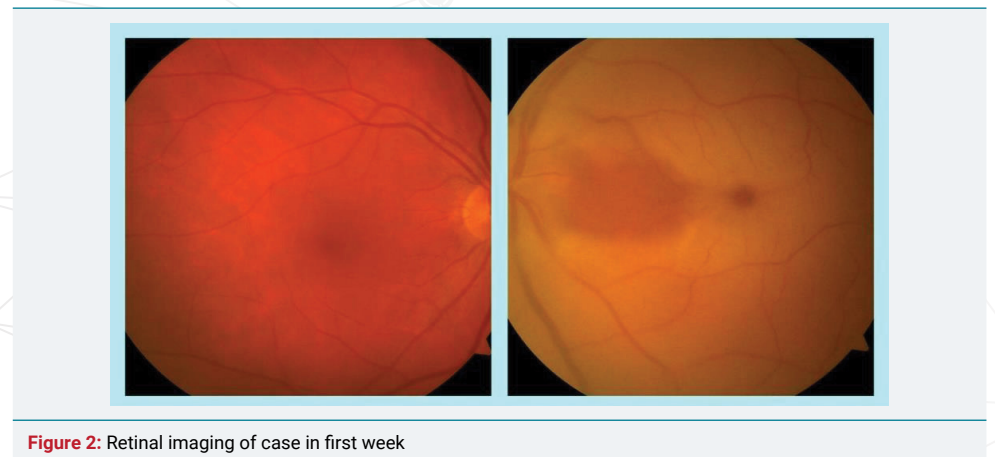
Figure 2: Retinal imaging of case in first week

On the other hand result of several reports has shown that HBOT within 24-48 hours after the inciting event, had impressive improvement of visual acuity, while the