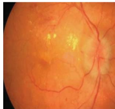
Figure 1: Shows bilateral optic disc edema before starting the antiedema measures.

Ocular toxicity induced by cancer chemotherapy is not uncommon, but the broad spectrum of reactions to injury displayed by the eye reflects the unique anatomical,