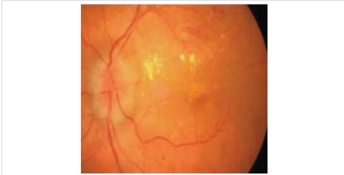
Figure 2: Shows bilateral optic disc edema before starting the antiedema measures.